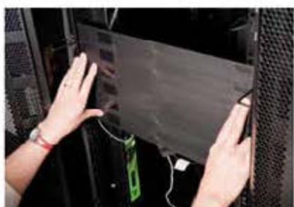
Push the clips firmly into position on each side