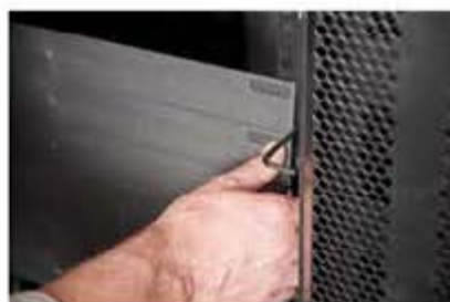
Place the panel in the required position and align the clips with 19" mounting holes