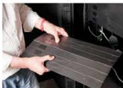
Easy selection of individual panel combinations. Firmly bend along desired position...