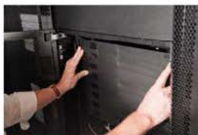
Insert the adjusted panel to fill the remaining open rack space.