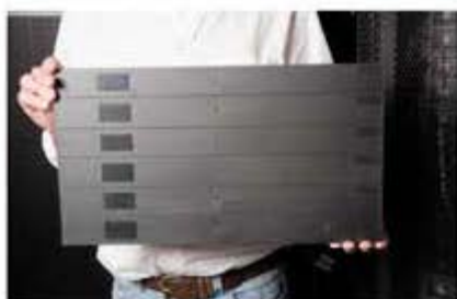
EZIBLANK® Installation, 6 x 1U Panel