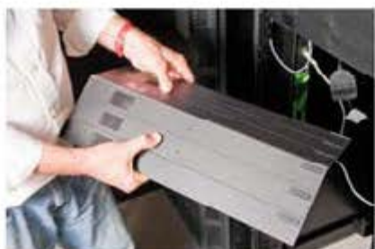
...fold backward and "snap" off as required.